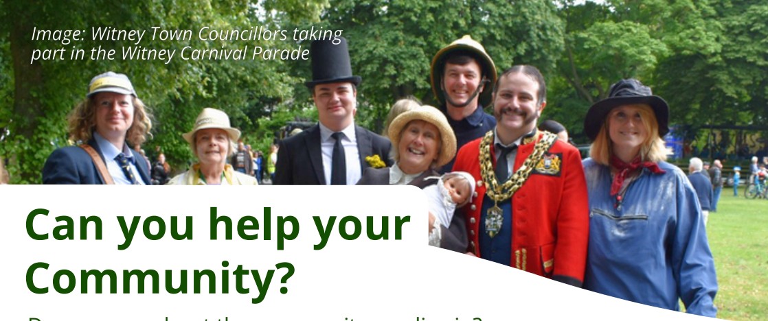
Image: Witney Town Councillors taking part in the Witney Carnival Parade